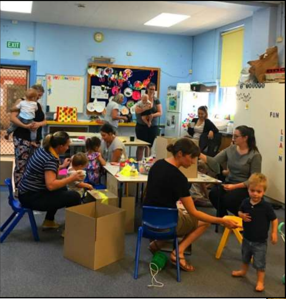
Playgroup is vibrant and a lot of fun. If you know someone with preschoolers, please encourage them to come and join in. See our previous flier for our special event on 10<sup>th</sup> April.